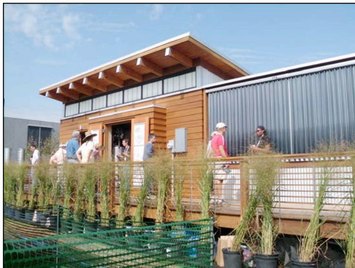
The winner of the 2011 Solar Decathlon, the University of Maryland's WaterShed House, features an Uponor crosslinked polyethylene (PEX) plumbing system.

On Oct. 3, the U.S. Department of Energy announced the winner of the 2011 Solar Decathlon competition, which awards collegiate teams for designing, building and operating the most cost-effective, energy-efficient and functional solar-powered homes. The University of Maryland's WaterShed house, which features an Uponor PEX plumbing system, came out on top with a total of 951.151 points out of 1,000.